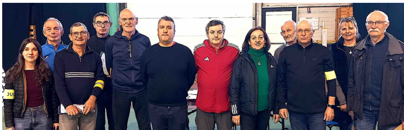
Nowhere to hide from this lot!